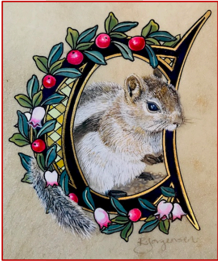
Renee Jorgensen: Illuminated letter 'C' for Chipmunk nestled within Bearberry fruits and flowers.