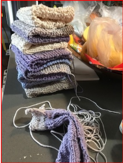
Alice Turak: Yarn arts