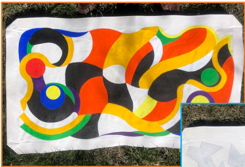
DJ Hamilton has been working on these two pieces showing design strength using repetitive shape, line and color.