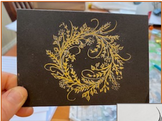
Sabra Kuykendall: Practicing Flourishing in Gold Ink and Bird Flourishing